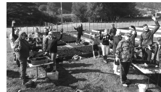
Volunteers having a great time potting up at the CHC nursery August 2018

September 21 st - potting up at CHC nursery