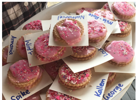
Delicious and heart-felt "Compliment Cookies"

Kōrero Mai, Kōrero Atu, Mauri Tū, Mauri Ora!