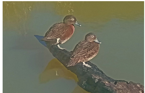
A pair of Pateke (Brown Teal) roosting in Colville Bay