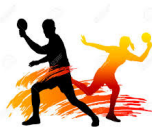
TABLE TENNIS at COLVILLE HALL FRIDAY NIGHTS 6.30 - 8.30 All welcome

If you would like a listing on the Panui events calendar, email the Panui Editor: panui@colville.org.nz