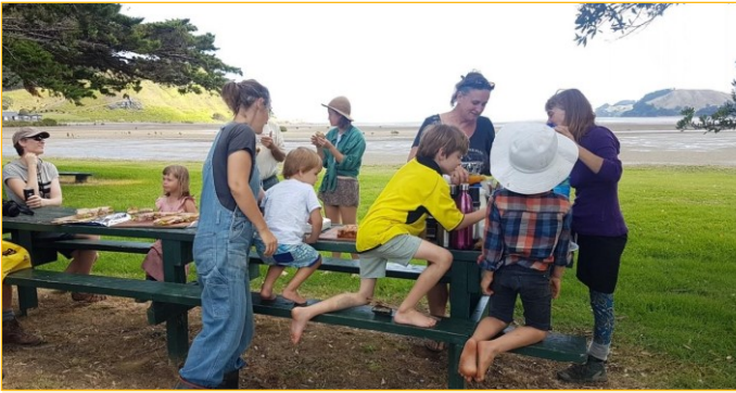
The crew sharing a well-deserved meal at the foreshore

After postponing the event in March, only to then have both coordinators isolating at home in April, the beach clean was at risk of not happening at all, until our wonderful community