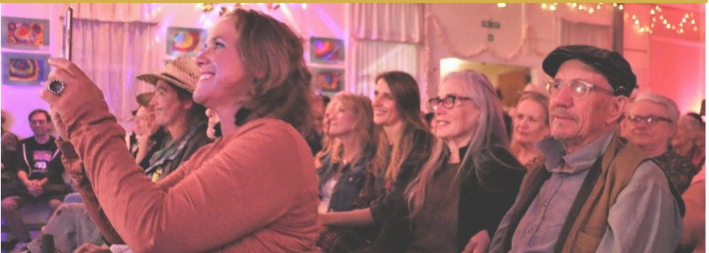
Last edition of the Colville Easter Festival—Colville sings Country!