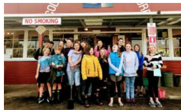
Kahu class celebrating with ice-blocks from Colville Store after planting along the Umangawha River.