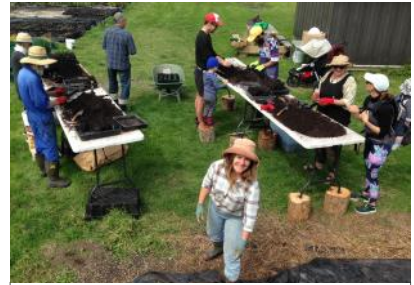
Potting party at the nursery last year.

Sat 2 nd October 10am – 2pm Sat 16 October 10am – 2pm