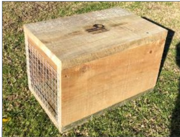
"An example of a MEG trap about to be deployed."