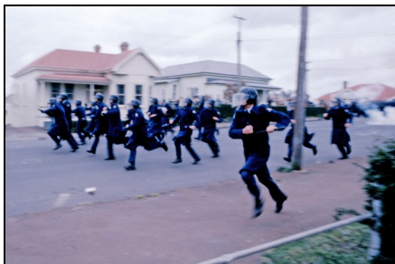
September the 12 th 1981, the day of the last test match

Come along and remember where you were in 1981, or if you weren't born then, learn a little Kiwi history.