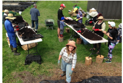
Potting party at the nursery last year.