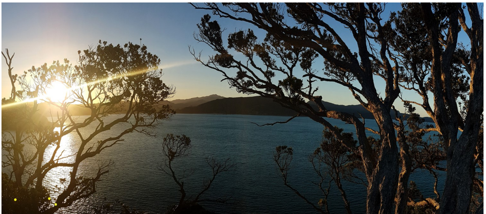
Looking over to Mt Moehau, from Little Bay.