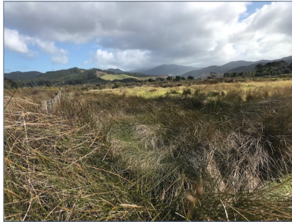
Installing ferret traps at Waikaway Bay

Starting in the Waikawau Bay area and focussing on the farm/bush margin, we are installing 26 ferret traps interspersed with our existing stoat traps, and using better lures and fresh meat baits (a ferret favourite). We will continue the trapping